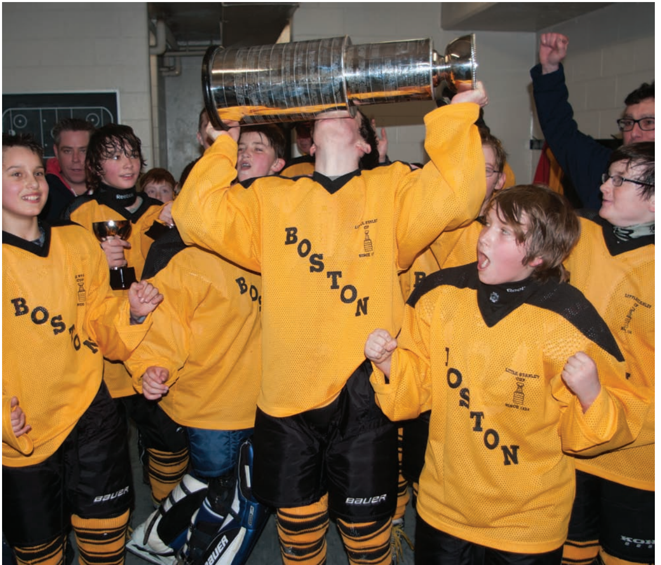
Peder Myhr // The Observer